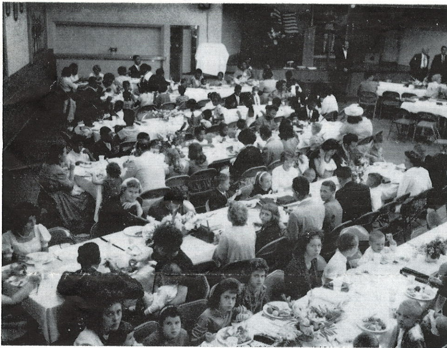
285 enjoyed feasting on Pentecost

The Houston Church of God brethren were privileged to meet for two full days of services during this Pentecost season. God's Church in Houston is enjoying a growth rate of about 30 percent per year giving us a total of 285 in attendance for a joyous festival. These services afforded much encouragement and correction to help qualify us to enter into God's Kingdom.